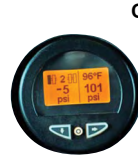
In Cab Display