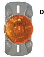
Trailer Lamp Display*